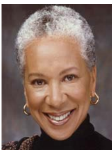
Angela Glover Blackwell , Founder of PolicyLink and co-author of Searching for the Uncommon Common Ground: New Dimensions on Race in America .